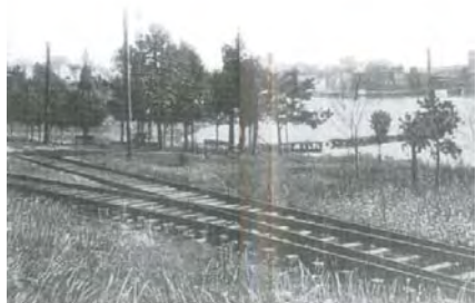
Glendale Park and Lake with dock

The Old Georgia Road crossed Lawson's Fork at the Shoals (upper) and led to increased settlement including the large plantations of William and Littleton Bagwell.