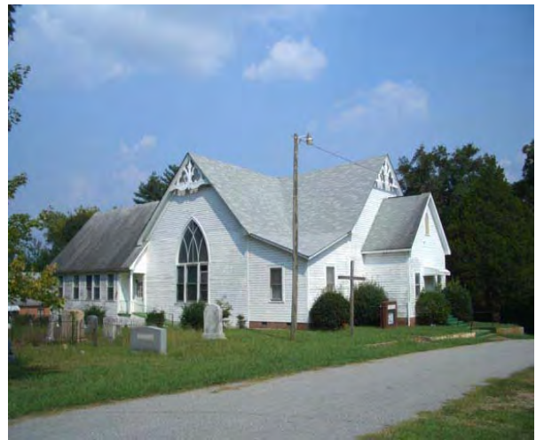
GOLS at former Glendale UM Church property