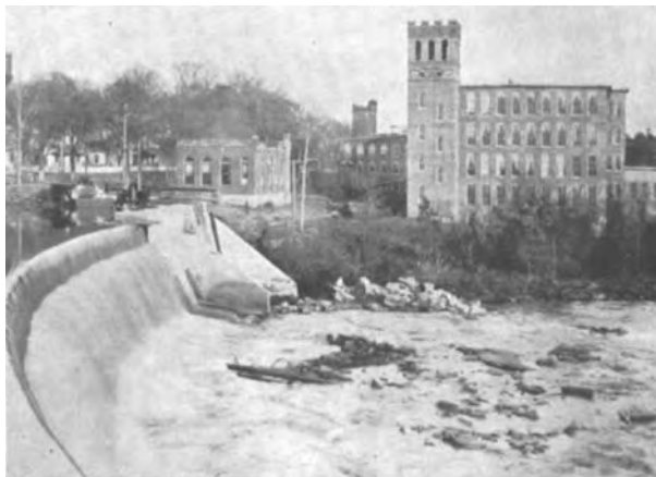
Glendale in the mid-1920's