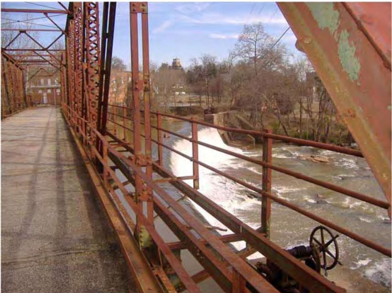
The old iron bridge, former company store, water tank, dam, and shoals at Glendale