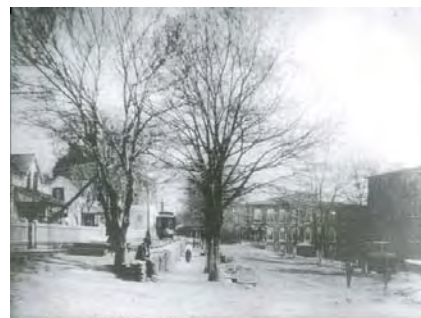
Glendale Mill with the trolley line at left