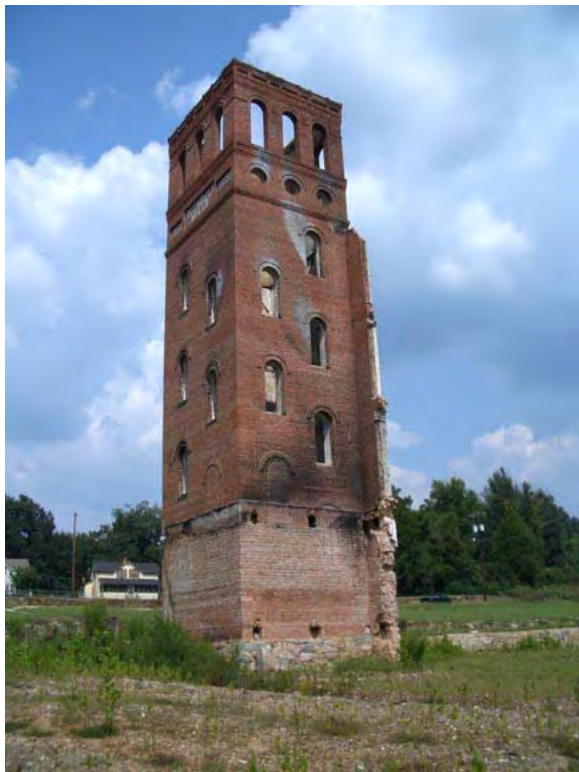
One of the two remaining towers at the site of the Glendale Mill