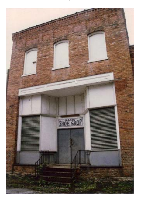
Sam's Shoe Shop