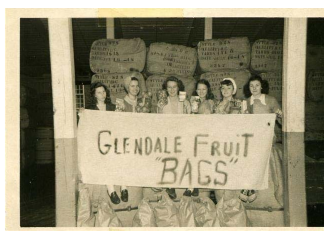
A group of Glendale girls that packed the fruit bags that were given to the mill workers for Christmas.