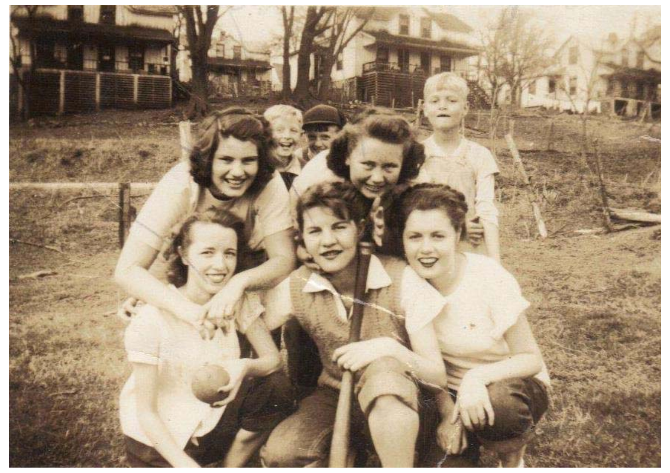
Glendale girls with houses on Holy Hill (later changed to Chapel street) in the background.